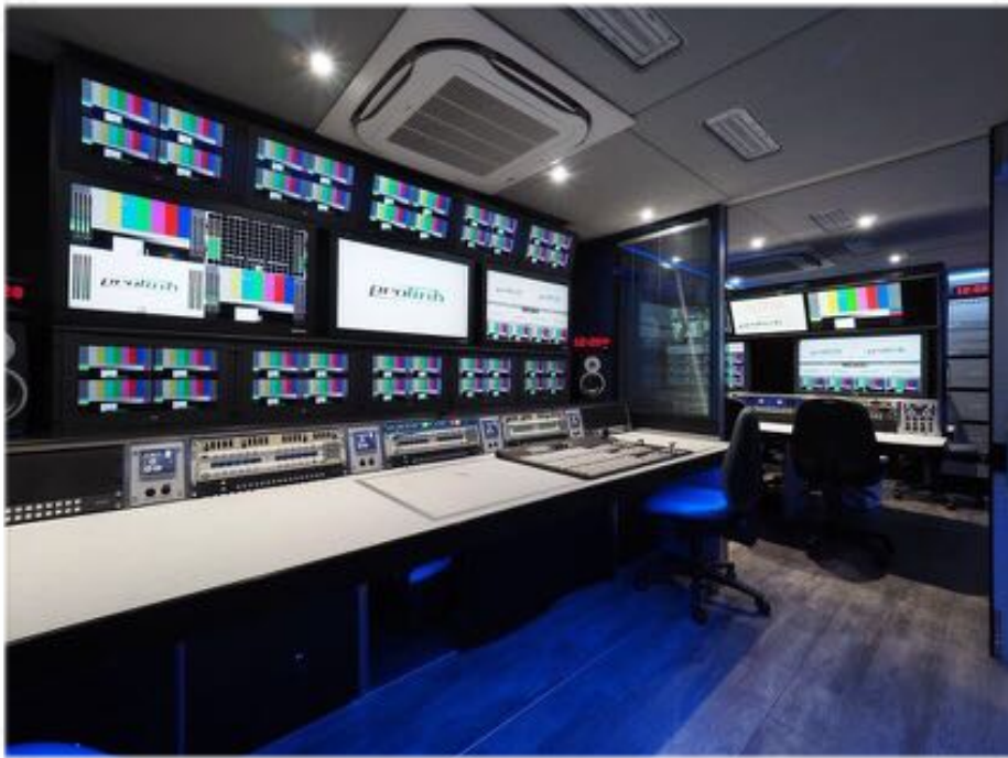
Front Production desk with space for 5 persons with VTR beyond