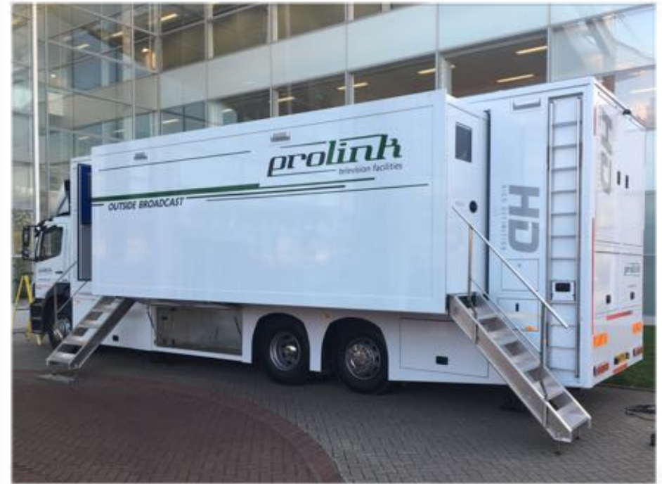
OB3- a 12m Rigid with large single expanding side